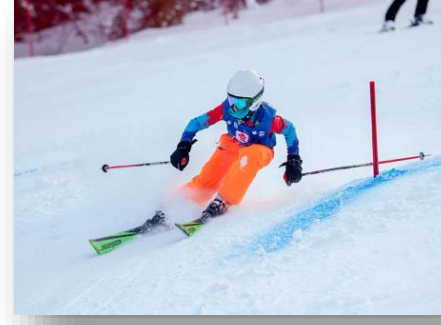
Stickers on guards and helmets